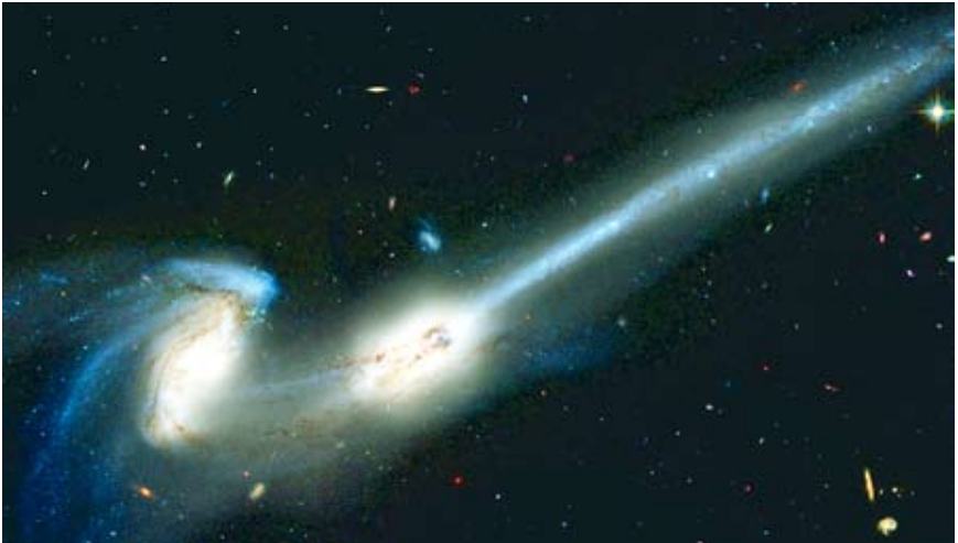
Image of the Mice Galaxies by NASA Hubble. Blue light comes from new, massive stars created by a “recent” collision of these galaxies that are 300 million light-years away. We see the Mice as they were 300 million years ago, before the first dinosaurs roamed the Earth. [pg. 206]

The Sombrero Galaxy is 28 million light-years away and has a mass of 800 billion suns. The light seen in this NASA Hubble image has taken 28 million years to reach us. So this is not an image of what the Sombrero looks like today; this is what it looked like 28 million years ago—long before humans existed. This ancient image has been preserved in the time capsule of light traveling across the vastness of space. Telescopes are time machines —they take us back in time and let us see the past as it is happening in real time. [pg. 208]